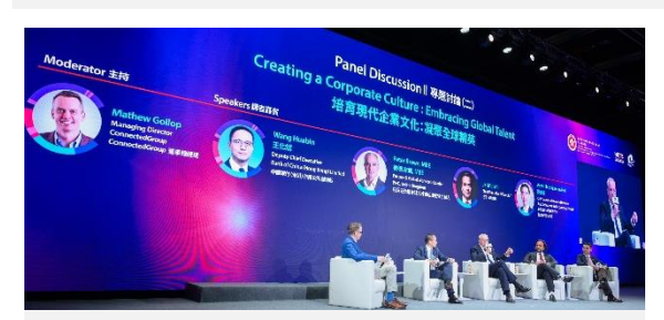
Hong Kong Talent Engage hosted the two-day Global Talent Summit · Hong Kong as the first talent-themed international forum and exhibition of the current-term Government. Photo shows a panel discussion at the International Talent Forum.